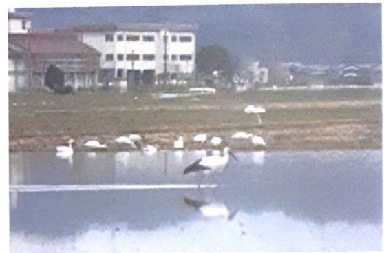
Winter Flooded Rice Paddies

"The stork friendly farming method" nurtures good rice and various living creatures. It is the method to aim to create a rich culture, community and environment in which the stork can also environment in which the stork can also live.