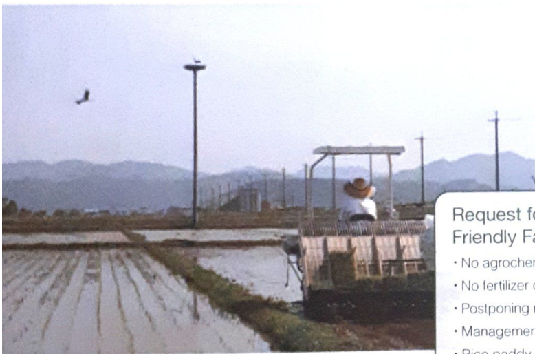
Important rice paddies for the stork